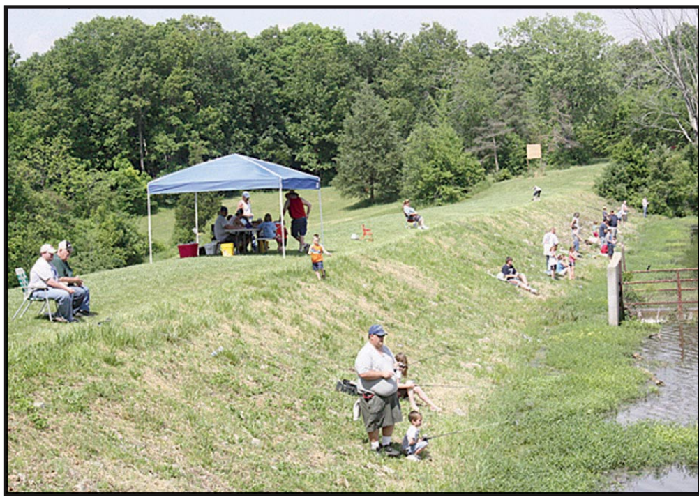
St. Elmo was a busy community over the weekend of May 5-6. Among the events was the Community Picnic and Bicycle Safety Day and the St. Elmo PTO Carnival and Auction on Saturday. Sunday was spent at Lake Nellie with the kids annual fishing tournament hosted by the Cumberland Trail Bass Club. Just a few of the family fishing teams participating in the event are shown above.